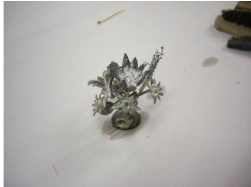
A 'tree' of cast silver items from the weekend