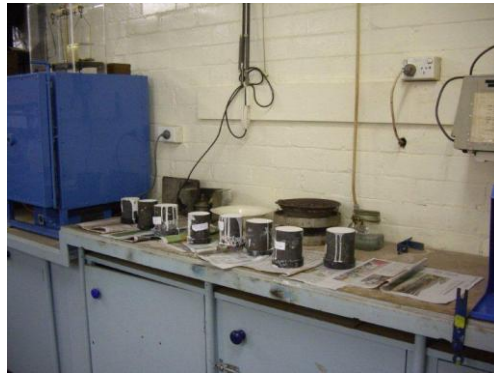
Casting flasks ready for pouring