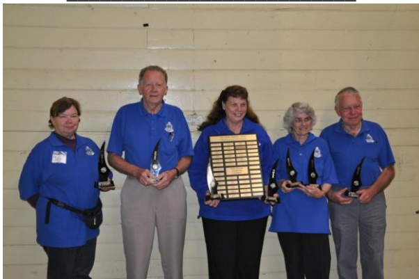
Our Team of Trophy Winners

A full list of all results from the GEMBOREE Can be found on www.aflaca.org.au , the website for AFLACA.