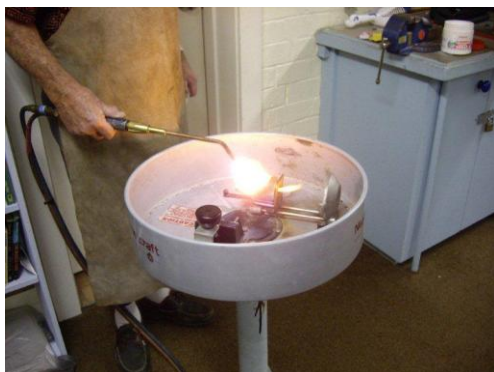
Melting silver in the centrifuge