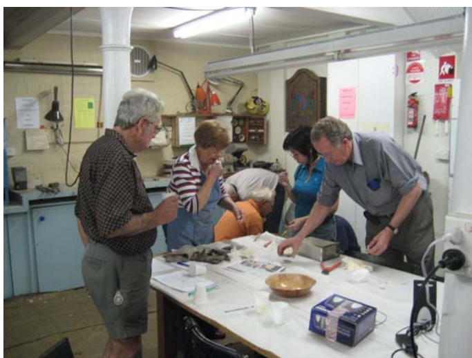
The Casting Group